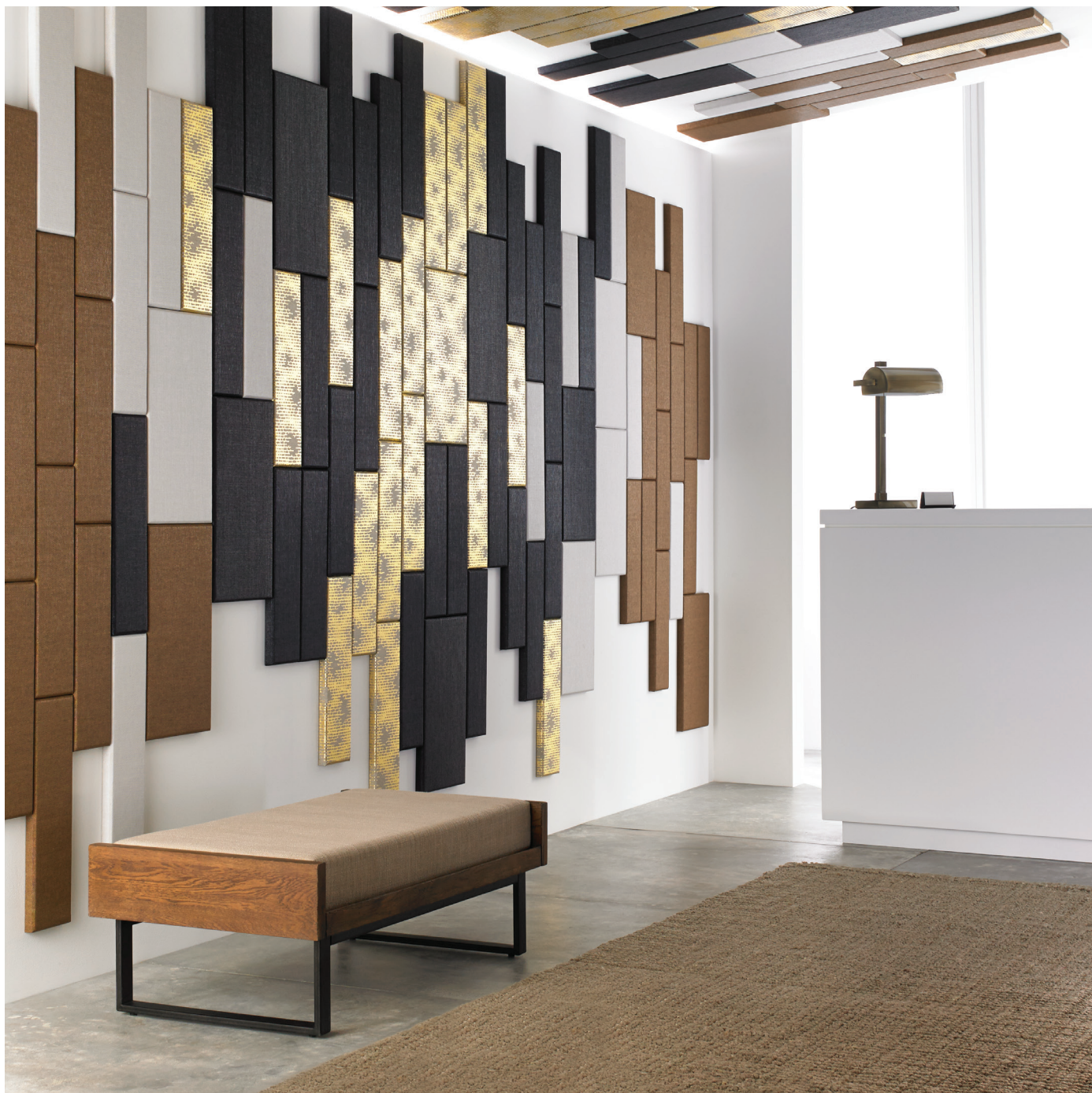
Plank in size Small, Large Fabric on Panels: Meteor 6427 colors 716, 759, and 752; Brigitte Couture 6289 color 830